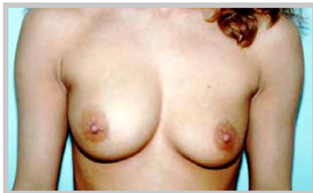
Photograph 2 shows a 29-year-old woman one year after having her silicone gel-filled breast implants removed. This is the same woman from Photograph 1.

One type of reoperation involves the surgical removal of your implants, which may or may not include implant replacement. As many as 20 percent of women who receive breast implants for breast augmentation have to have their implant removed within 8-10 years. Over the course of your life, you may need to have your implant removed due to local complications. Many women have their implants replaced, but some women do not. Women who do not have their implants replaced may have cosmetically undesirable dimpling, puckering, or sagging of the natural breast following implant removal.