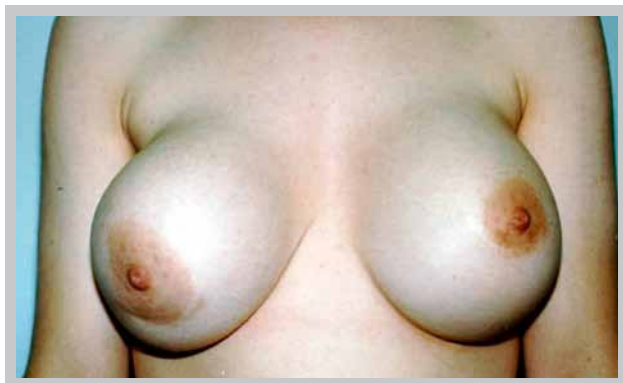
Photograph 1 shows Grade IV capsular contracture in the right breast of a 29-year-old woman seven years after placement of silicone gel-filled breast implants.

Grades III and IV capsular contracture are considered severe, and may require reoperation or implant removal. Capsular contracture, whether mild, moderate or severe, may occur more than once in the same implant.