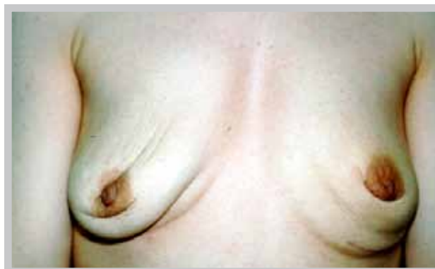
Photograph 3 shows deflated saline-filled breast implants in a 30-year-old woman.

Deflation occurs when the shell of a saline-filled breast implant tears or when the seal around the valve used to fill the implant is broken and liquid saline leaks out from the implant. When saline-filled breast implants deflate, loss of size or shape of the implant can be noticed immediately, or it may progress slowly over a period of days.